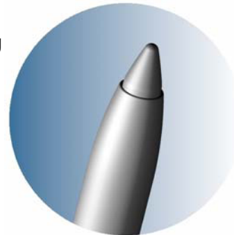
Illustrated detailed view of Pilot's round tip.