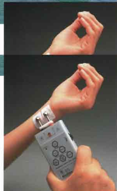
Low Battery and Open Circuit Indicator.