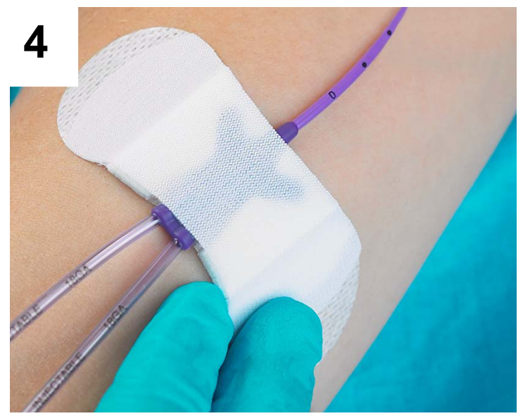
Secure the top strap over the catheter hub and press the adhesive in place. The top strap can be peeled back to inspect and adjust the catheter hub.