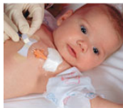
GRIP-LOK™ H Hydrocolloid Universal Catheter and Tubing Securement