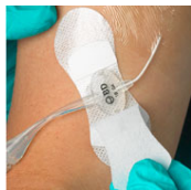
GRIP-LOK® WA Universal PICC Catheter Securement