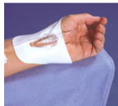
Zefon Arterial Anchor Bandage