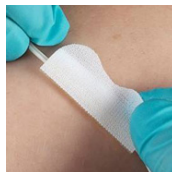
GRIP-LOK™ NGH Hydrocolloid Nasal Gastric Securement