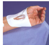
Zefon Arterial Anchor Bandage