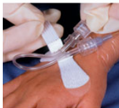
GRIP-LOK™ Universal Catheter and Tubing Securement