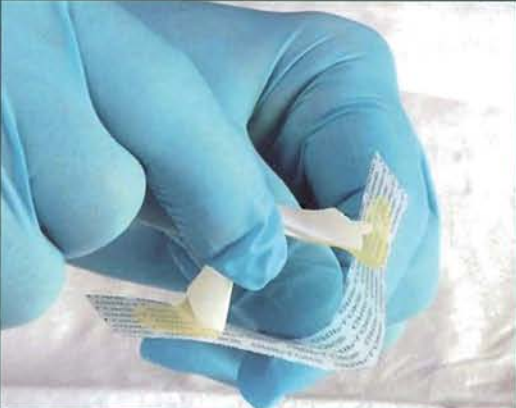
New Grip-Lok H release liners make it easy to apply.

Product Number: 3200SH Size: Small Tubing Range: 1.5-4.5mm